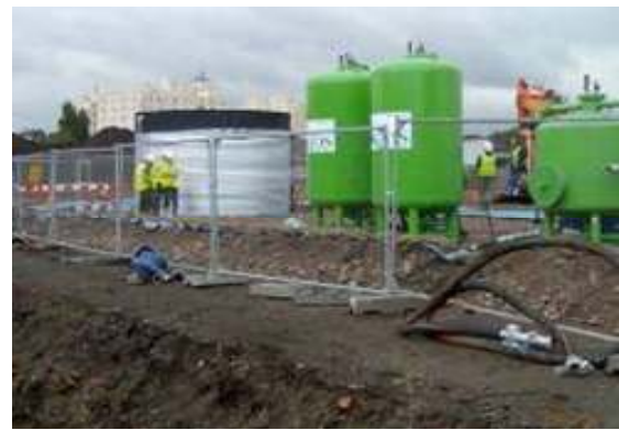
Bio-Pile and Water Treatment Plant

Forkers were also engaged to carry out drainage, infrastructure and highway works for the project which included;