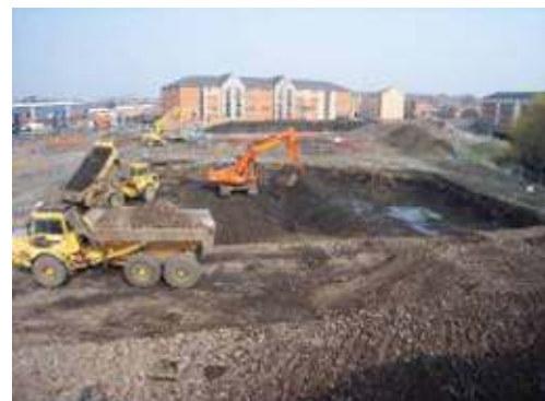
Excavation of TPH hot spots