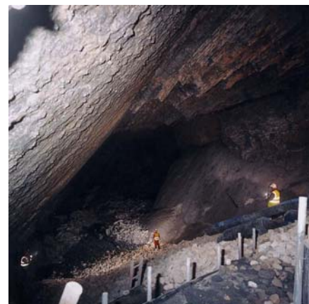
View of Northern Gallery from working platform