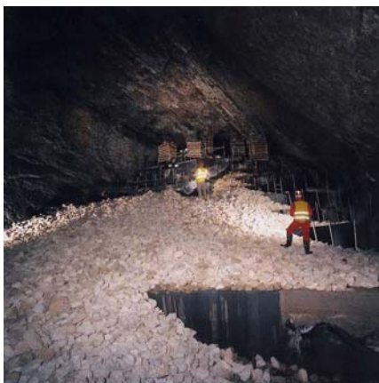
Northern Gallery showing supported working platform, barrier steps, and infilled limestone.