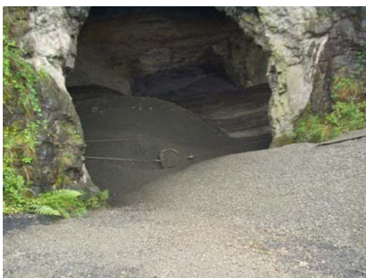
‘Slusher’ distributing infill stone