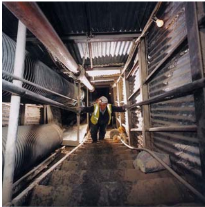
View down completed tunnel

The tunnel is 40m long and driven down dip at an angle of 38°. Frames were set at 1.2m and bolted to the mine roof.