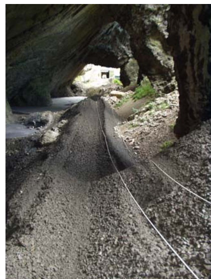
View through gallery at start of stone infilling