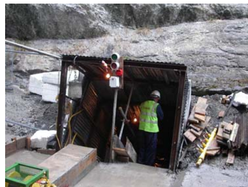
View of tunnel portal