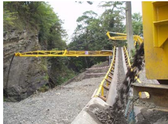
Secondary belt with bridge belt