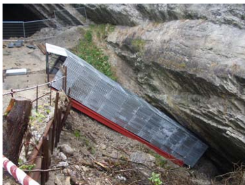
Tunnel portal section prior to filling over

Once this "outer" portal section of the tunnel was in place it was surrounded in concrete and then imported dolerite stone was placed over the tunnel and filled against the face of the exposed work face to provide stability and protection.